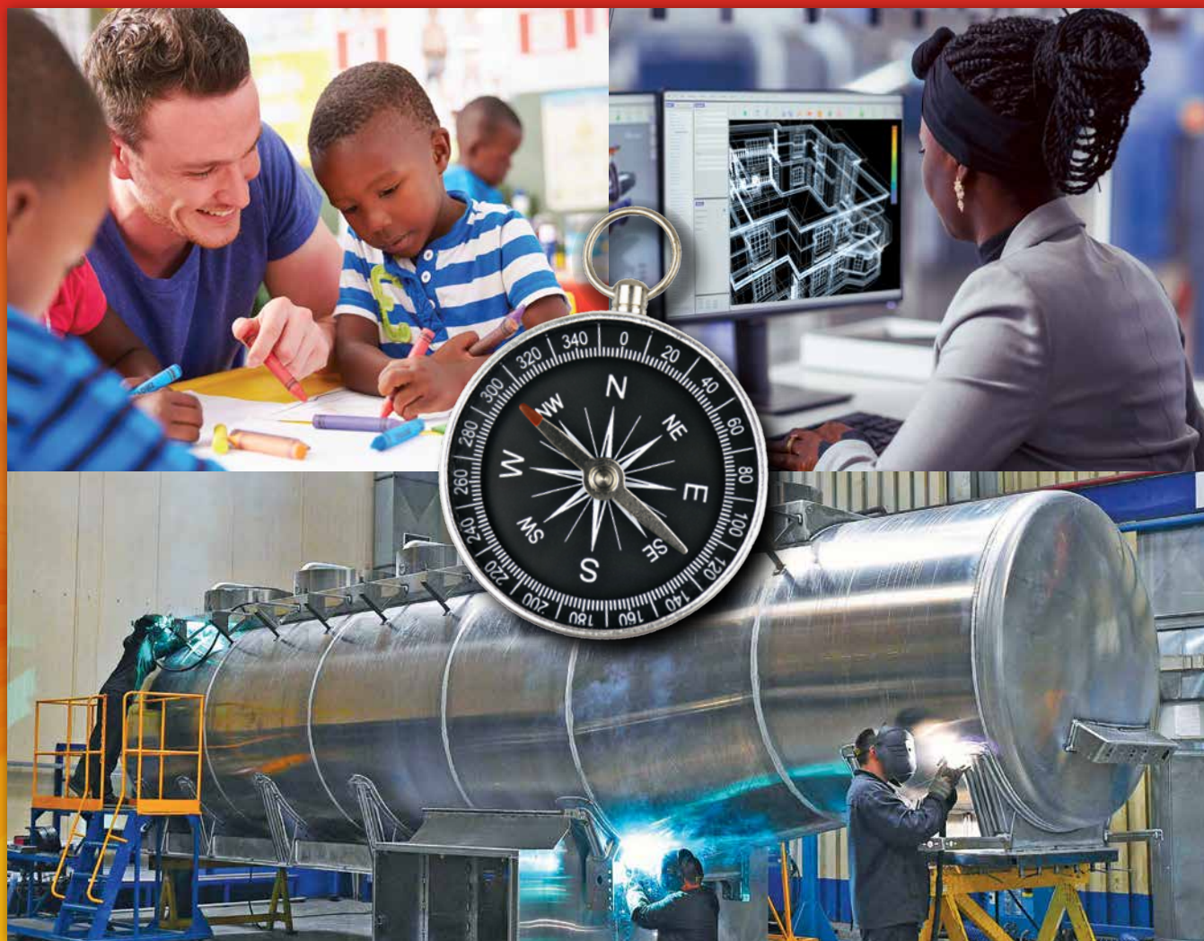
Chart Your Course with WCJC