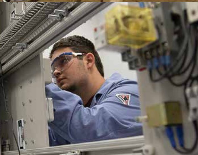
CHART YOUR COURSE WITH WCJC